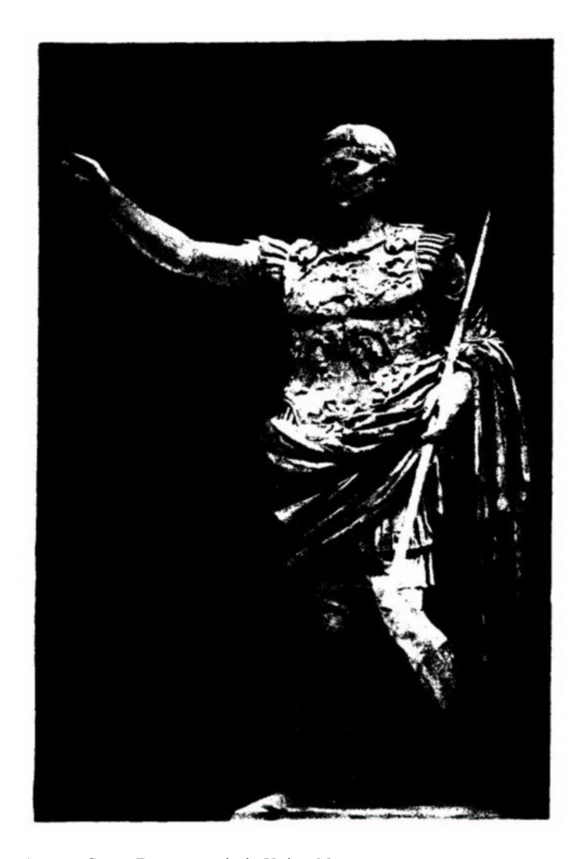
Augustus Caesar. From a statue in the Vatican Museum