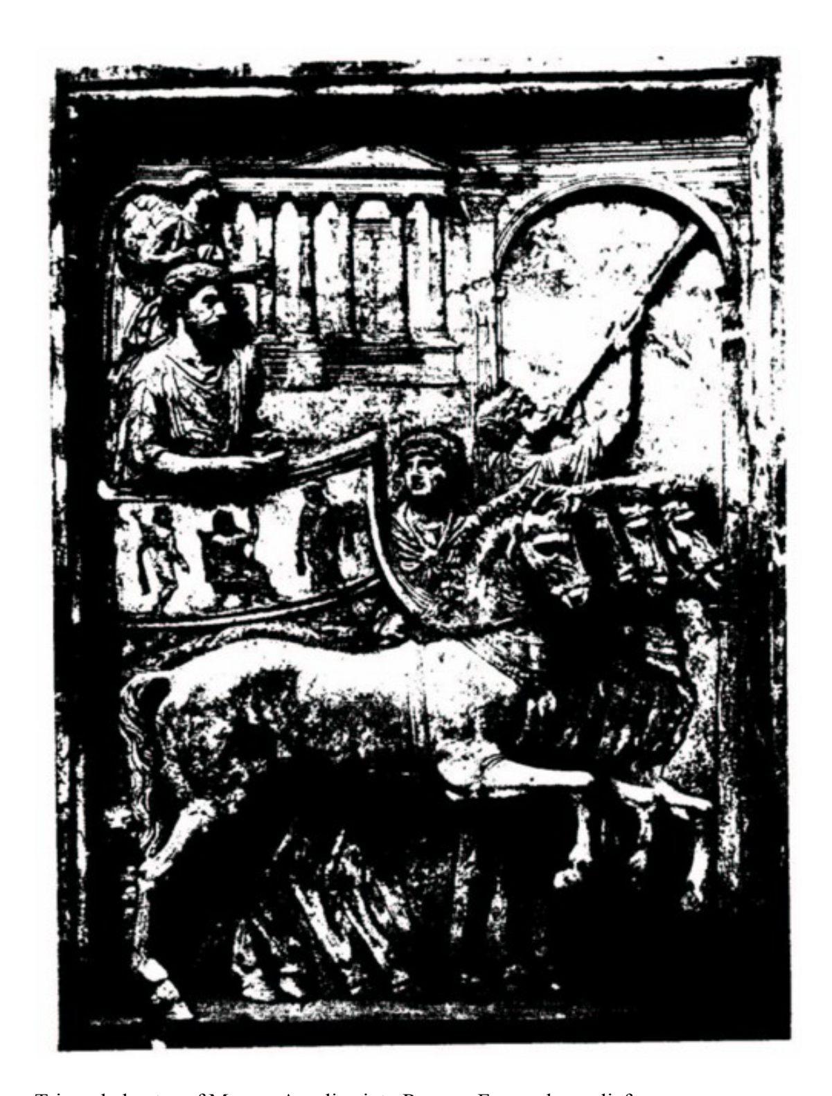
Triumphal entry of Marcus Aurelius into Roome. From a bas-relief.

If a man were called to fix the period in the history of the world during which the condition of the human race was most happy and prosperous, he would, without hesitation, name that which elapsed from the death of Domitian to the accession of Commodus. The vast extent of the Roman empire was governed by absolute power, under the guidance of virtue and wisdom. The armies were restrained by the firm but gentle hand of four successive emperors, whose characters and authority commanded involuntary respect. The forms of the civil administration were carefully preserved by