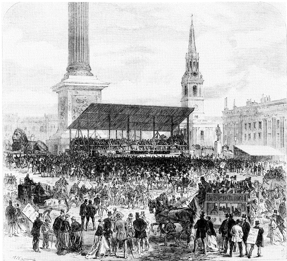
“Nomination of Candidates for Westminster at the Hustings, Charing Cross”

Illustrated London News , 21 November, 1868, p. 485