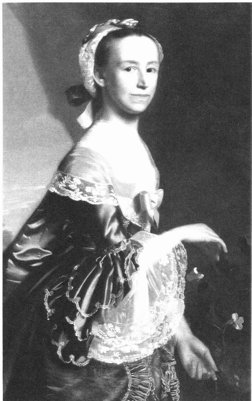
MERCY OTIS WARREN